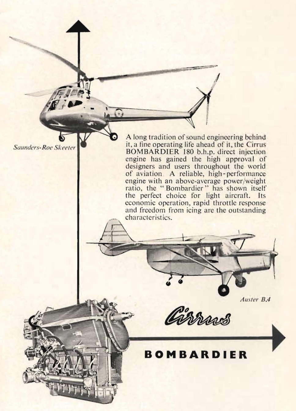
Blackburn and General Aircraft Limited. Brough, E. Yorks